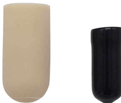
Storing caps: beige for sleeve for liquids, black for penetration sleeve

We pay your attention to the favourable price, much lower than the price of electrodes for similar purposes offered by their companies.