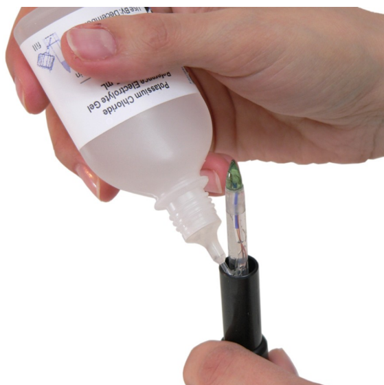
Refilling the electrolyte