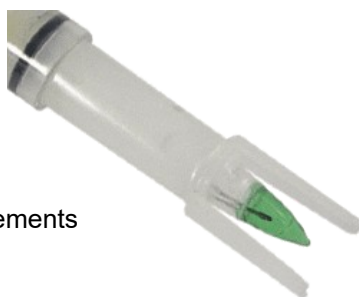
Sleeve for measurements in liquid samples

Plastic sleeve which protects the junction is an integral part of the electrode. It is impossible to use the electrode without the sleeve. The sleeve may be exchanged and it's kind depends on the type of the measured sample.